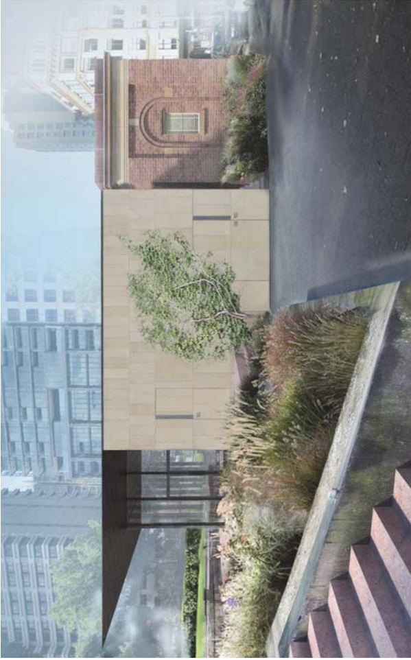
01-VIEW FROM NORTH-WEST