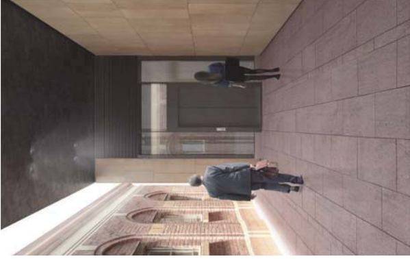
02-VIEW OF LOBBY LOOKING TOWARDS LIFT