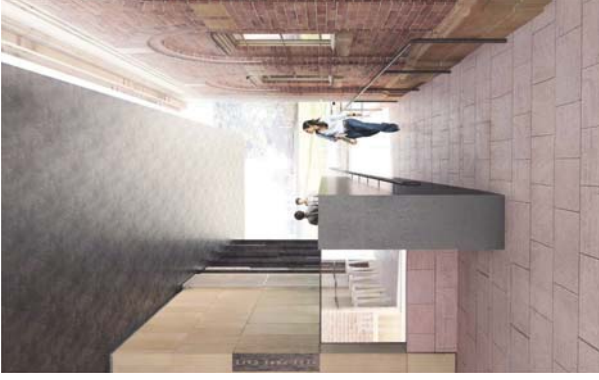
04-VIEW OF LOBBY PEDESTRIAN RAMP

COMPLIANCE ALL WORK SHALL BE IN ACCORDANCE WITH THE BUILDING REGULATIONS 2011 AND THE BUILDING REGULATIONS 2011 (AS AMENDED). ALL WORK SHALL BE IN ACCORDANCE WITH THE BUILDING REGULATIONS 2011 (AS AMENDED) AND THE BUILDING REGULATIONS 2011 (AS AMENDED). ALL WORK SHALL BE IN ACCORDANCE WITH THE BUILDING REGULATIONS 2011 (AS AMENDED) AND THE BUILDING REGULATIONS 2011 (AS AMENDED). ALL WORK SHALL BE IN ACCORDANCE WITH THE BUILDING REGULATIONS 2011 (AS AMENDED) AND THE BUILDING REGULATIONS 2011 (AS AMENDED).